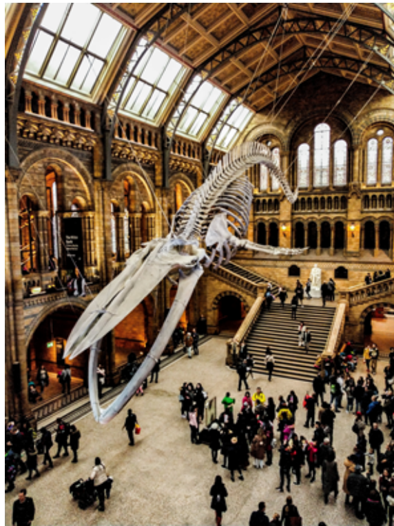
This is the Natural History Museum in London, it is still open today.