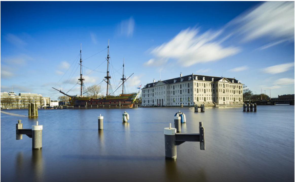
A maritime museum stores objects belonging to ships and things relating to travel at sea. This is the National Maritime Museum in The Netherlands