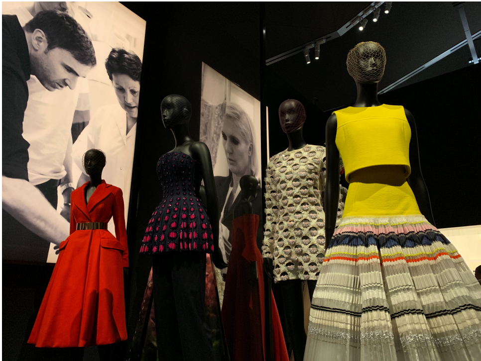
There are also museums for decorative arts and design. Here you can see designer clothes and fashion on display at the Victoria and Albert Museum in London.