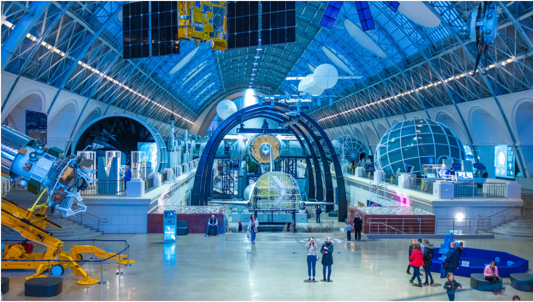
Science museums explore cool experiments and are lots of fun.