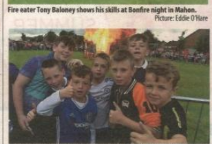
Youngsters give the thumbs-up to the fun at the Mahon event.