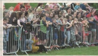
Crowds at the Bonfire night celebrations at Mahon last night.

Cork City Council was also celebrating the tenth year of its official bonfires in communities throughout the city, with major events taking place in Knocknaheeny, Mayfield, Mahon, Toghra and Farranmore. Huge crowds could also be found in Douglas, Bishopscourt and numerous other parts of Cork as the entire city came together to mark the occasion. The ever-popular Dowricha Puppets contributed a number of eye-catching sculptures to mark the occasion, with everything from giant cars and buses to Viking ships and even a giant fidget-spinner going up in flames. Family fun events, including bouncy castles and even a fire eater, were provided on the night. Unlike previous years, the weather even played its part. Cork city fire services were on hand to ensure that a safe night was had by all, with two trained fire technicians on site at each of the official events. The night had previously been renowned as one of the busiest of the year for fire crews and gardai in Cork city. Antisocial behaviour and dangerous activity has decreased in recent years though, coinciding with Cork City Council taking control of the events. While a number of unauthorised events did take place throughout the city, gardai at Anglesea Street said there were no major incidents to report. A spokesperson at the station said: "It was quite busy in terms of calls but there were no major incidents to report. It was busy but there was nothing unusual in terms of a normal Friday night."