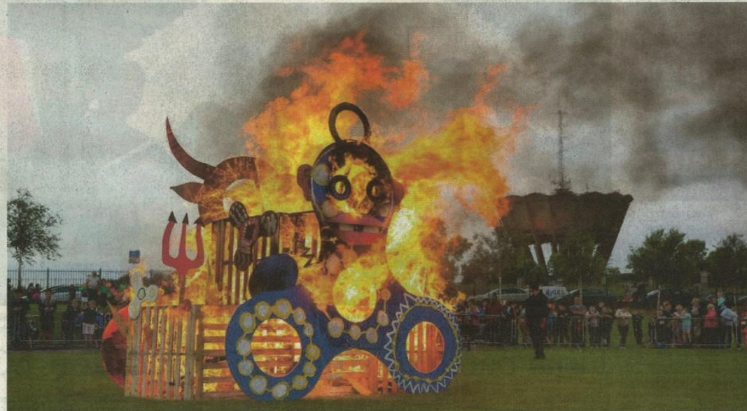
The 'Devil/Angel Fidget Spinner' sculpture by Downtcha Puppets at the Bonfire Night Family Fun Night event in Kilmore Rd, Cork.