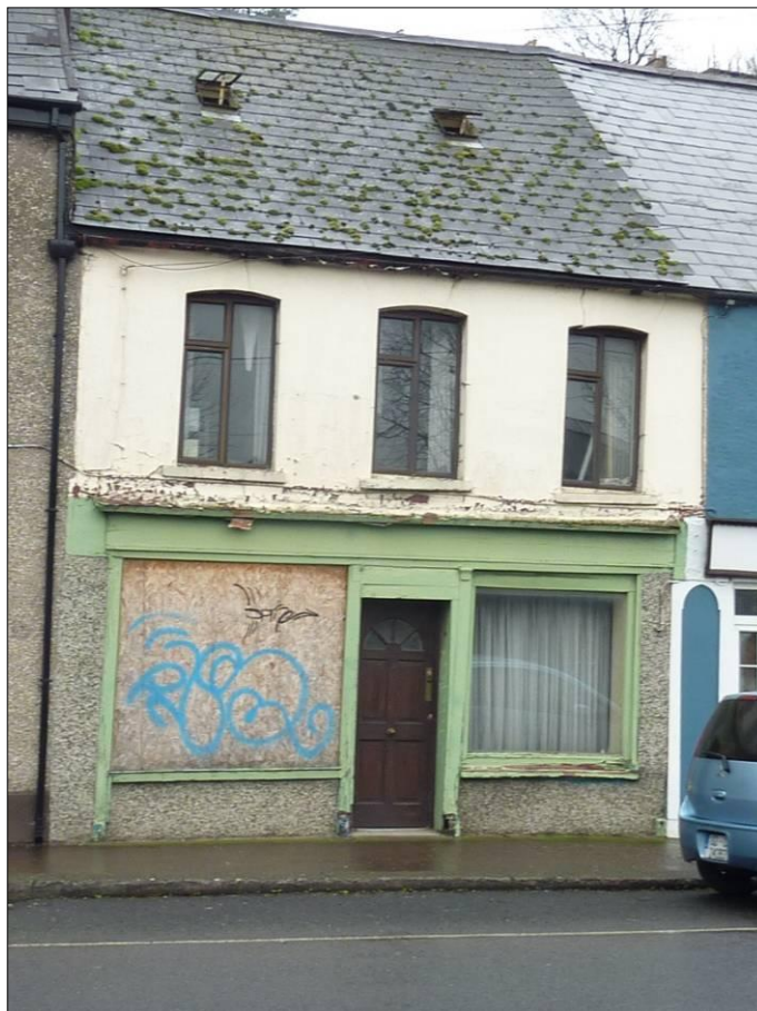
125 Lower Glanmire Road: The premises sold in recent months. The new owner is meeting with the Planning Department next week to discuss refurbishment proposals.