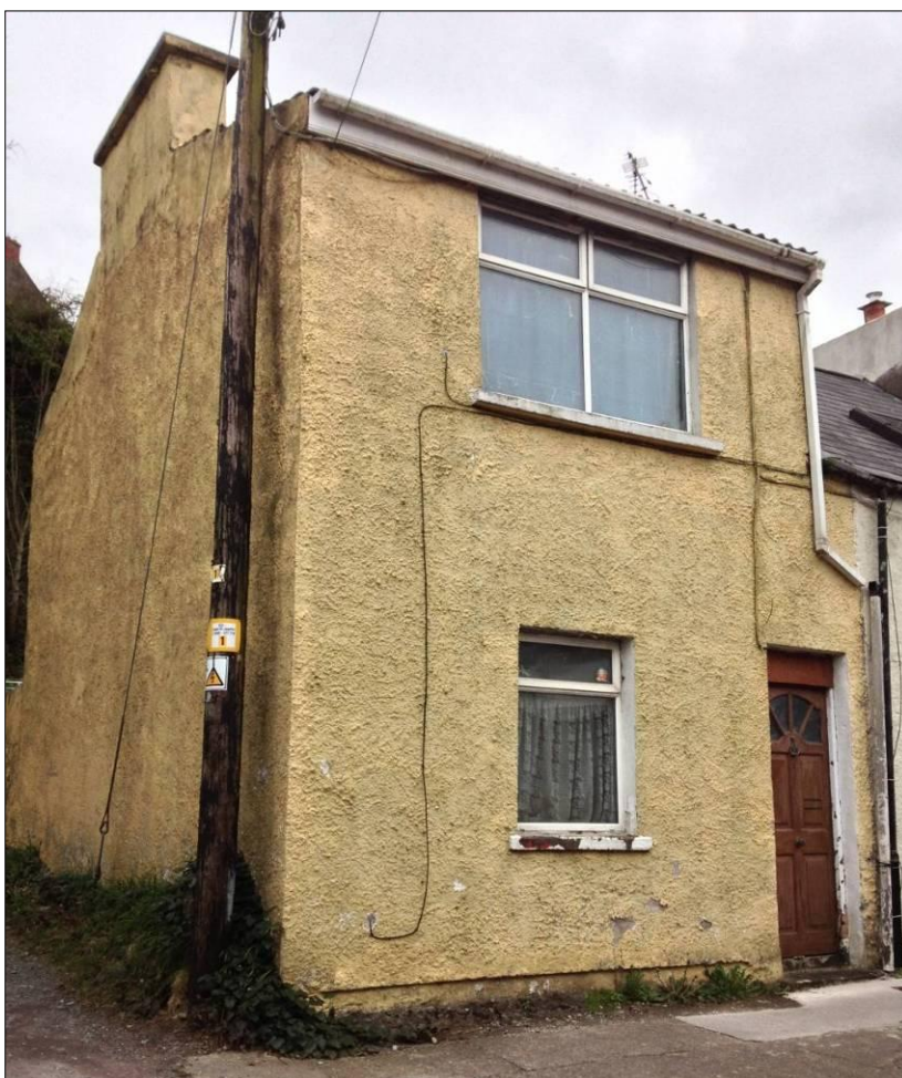
1 Windsor Cottages, off Ballyhooly Road: Estimated vacant for at least five years. Ownership investigation underway.