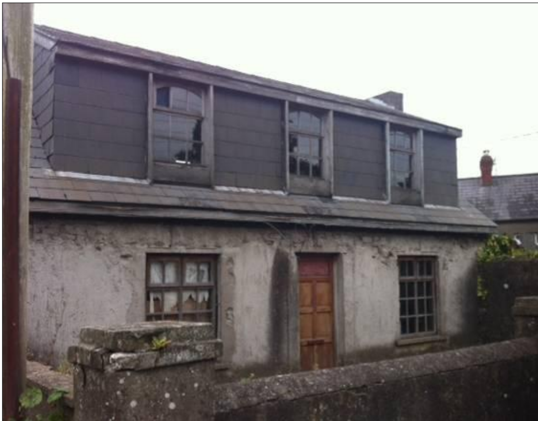
122 Gardiner's Hill: Estimated vacant for some 12 years. Some missing glazing, unfinished plasterwork, no rain water goods.