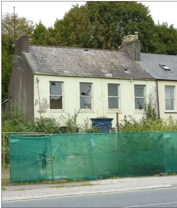
1 Tivoli Gardens, Lower Glanmire Road: Sale agreed; have sought written undertaking and timeframe from prospective new owner to carry out works immediately.