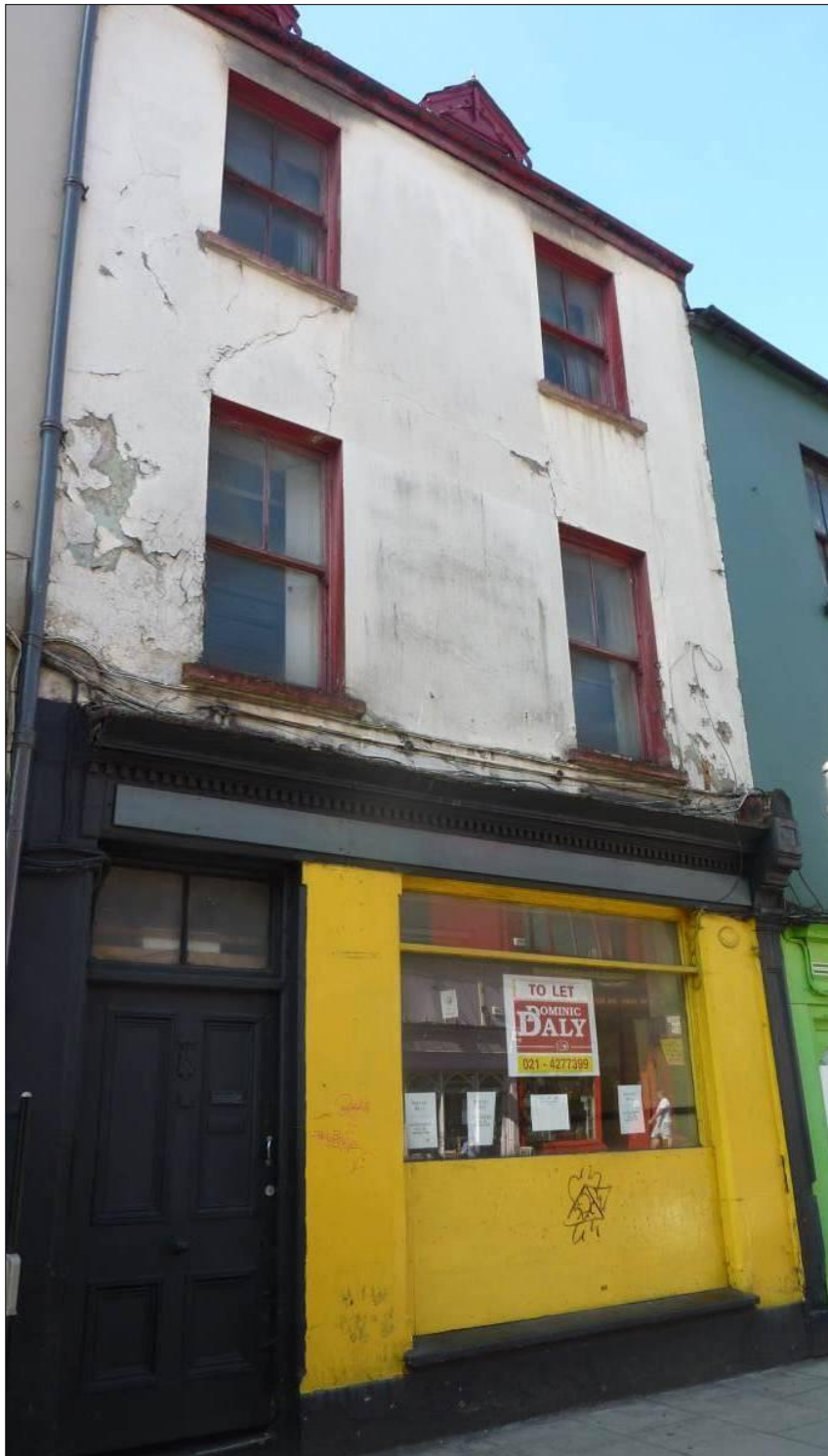
18 MacCurtain Street: Unsightly commercial premises.

I recommend that the Committee note the position and refer the report to An Chomhairle for approval.