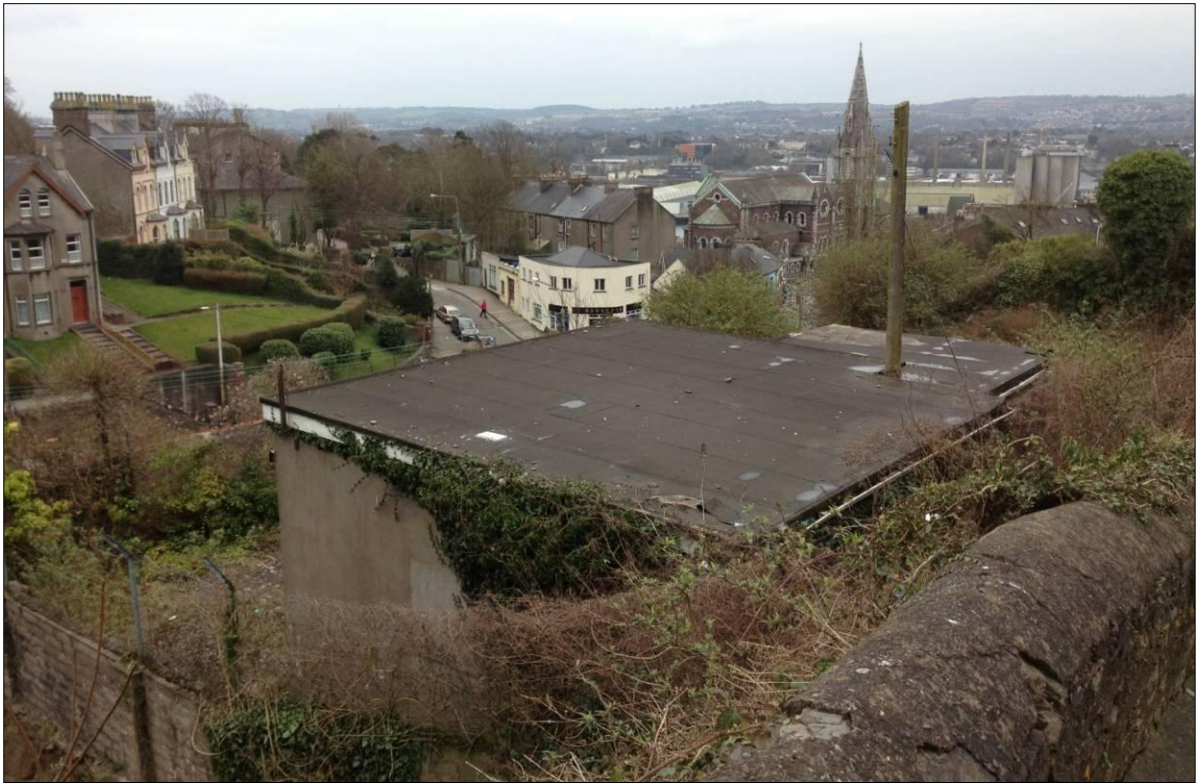
Alexandra Road, St. Luke's: Planning permission granted for three townhouses; the site is currently for sale.