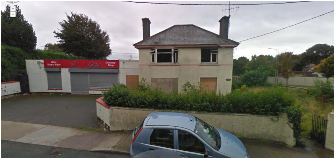
Deelish House: Placement on the Derelict Sites Register in September 2014.