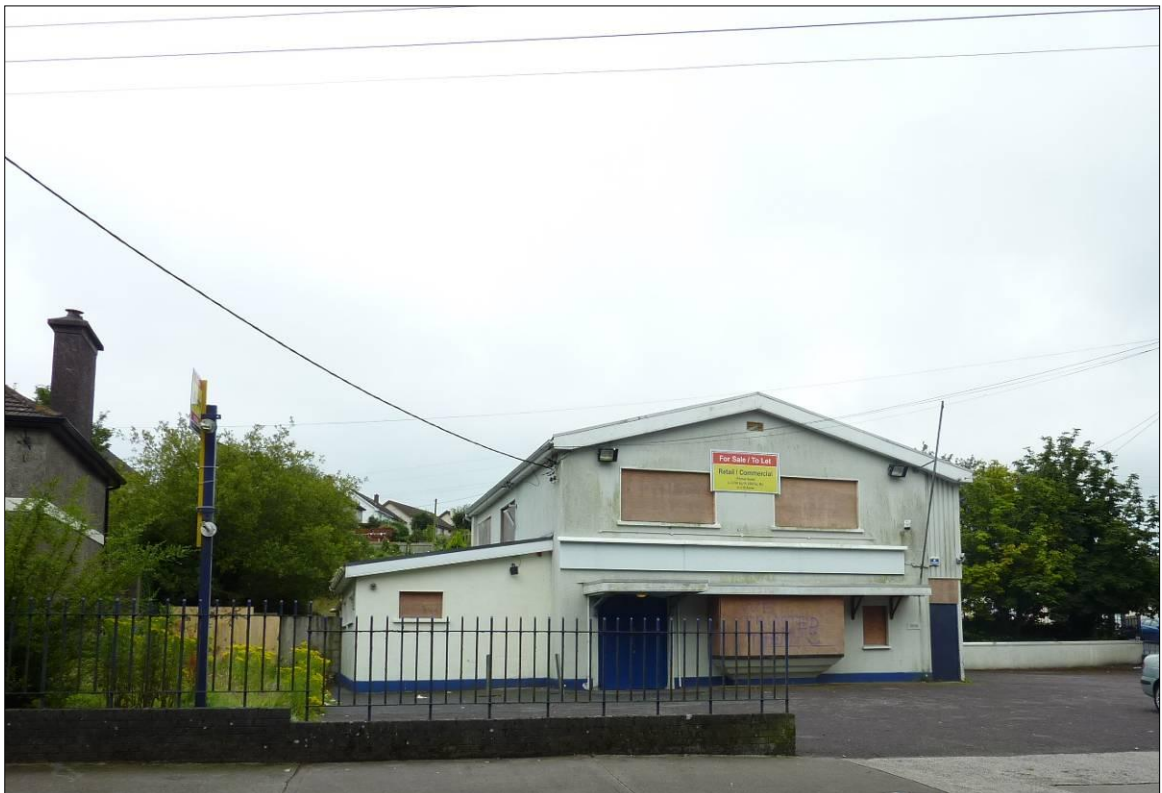
Former TSB Bank, Iona Park, Mayfield: Premises is sale agreed but title issue needs to be addressed before sale can close. The estate agent has advised that the prospective purchaser intends to occupy the building immediately upon completion of the sale.