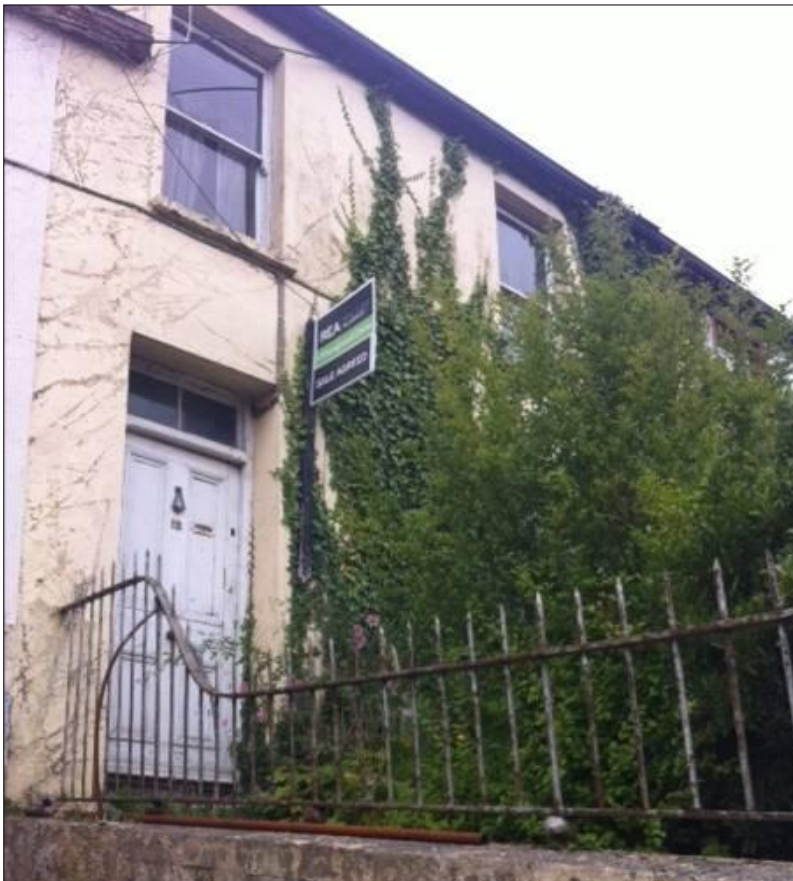
12 Mount View Terrace, Ballyhooly Road: Sale agreed, have sought written undertaking and timeframe from prospective new owner.