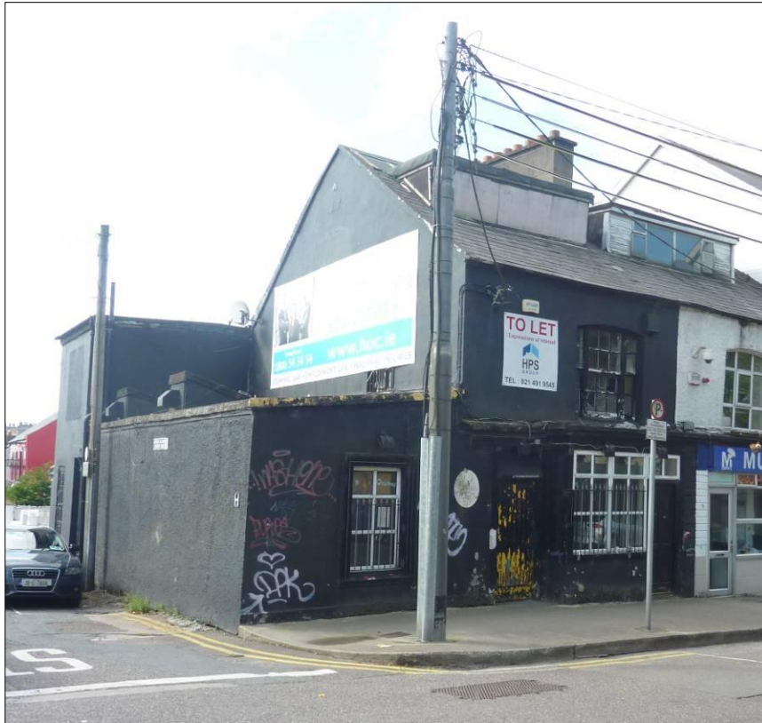
180 Old Youghal Road: New file; issued letter to owner requesting works be