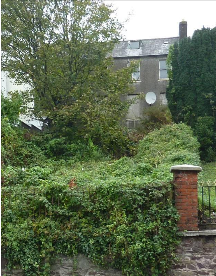
1 Adelaide Terrace, Summerhill North (site goes through to Wellington Road). Sale agreed; have sought written undertaking and timeframe from prospective new owner.