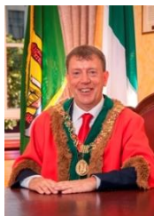
Lord Mayor Cllr. Tony Fitzgerald

Another priority for the next three years is to bring the flood defences in play for Cork business, residents and visitors to the city. We need to give certainty in terms of mitigating against those risks. We all want a prosperous sustainable city but we have to bring certainty in relation to flooding and we must do that as sensitively as is practicable.